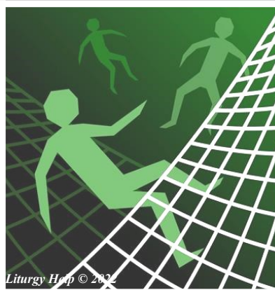
Liturgy Hop

A quotation often attributed to St Francis reminds us: "Preach the Gospel at all times. If necessary, use words."